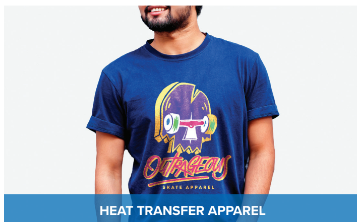
HEAT TRANSFER APPAREL