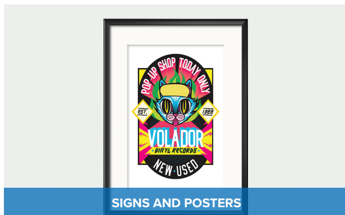
SIGNS AND POSTERS