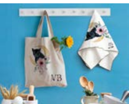
ACCESSORIES AND GIFTS